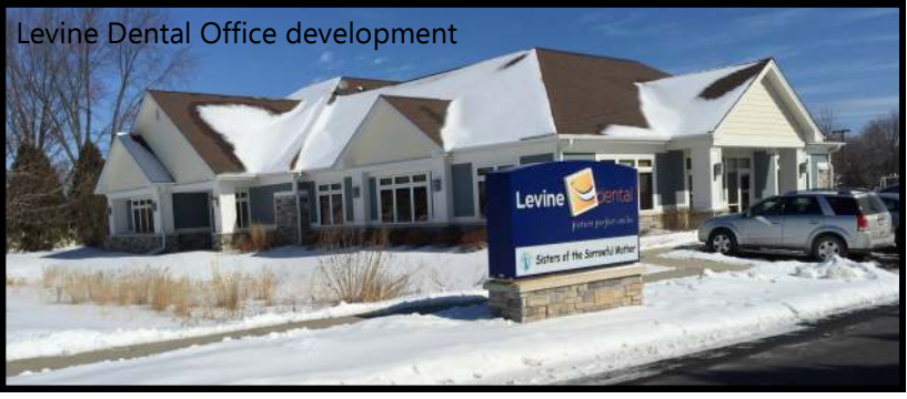
Levine Dental Office development

Retail/office building anchored by Concentra at North 55th Street.