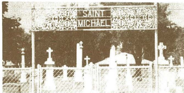
ST. MICHAEL'S CEMETERY (1843) First known as Irish Cemetery. Intersection of North Sherman Boulevard and West Calumet Road.

^ WISCONSIN HERITAGE DIRECTIONAL SIGN On north side of Brown Deer Road between North Deerbrook Trail and North Arbon Drive