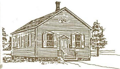
1884 BROWN DEER SCHOOL Brown Deer Village Park 4800 West Greenbrook Drive

^ WISCONSIN HERITAGE DIRECTIONAL SIGN On north side of Brown Deer Road between North Deerbrook Trail and North Arbon Drive